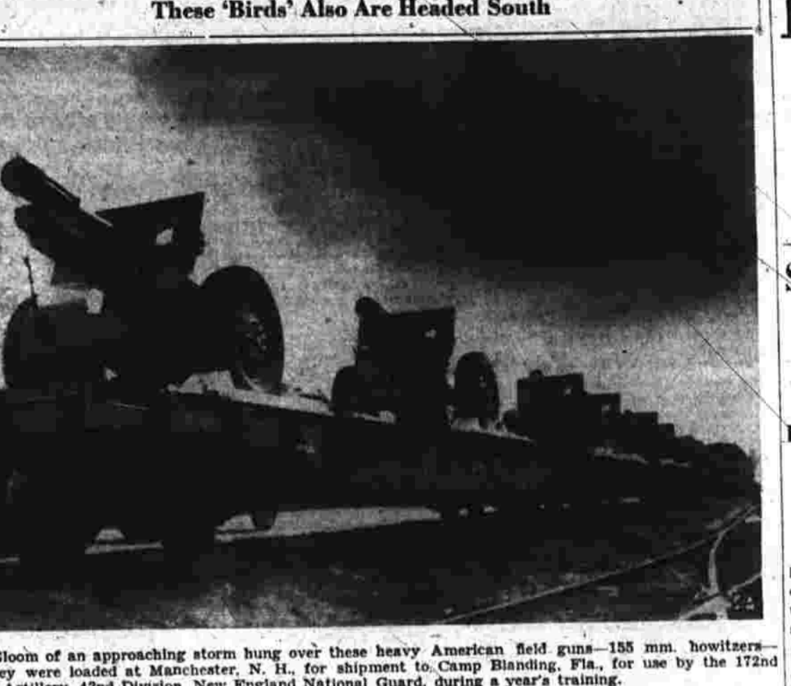
Gloom of an approaching storm hung over these heavy American field guns—105 mm. howitzers—as they were loaded at Manchester, N. H. for shipment to Camp Blanding, Fla. for use by the 12th Artillery, 42nd Division, New England National Guard, during a year's training.

Bolton, Mass., March 8.—(AP)—Two women were hospitalized today as a result of a fire which broke out in the Methodist Episcopal Church in Bolton. The fire, which started in the church's kitchen, caused $20,000 worth of damage.